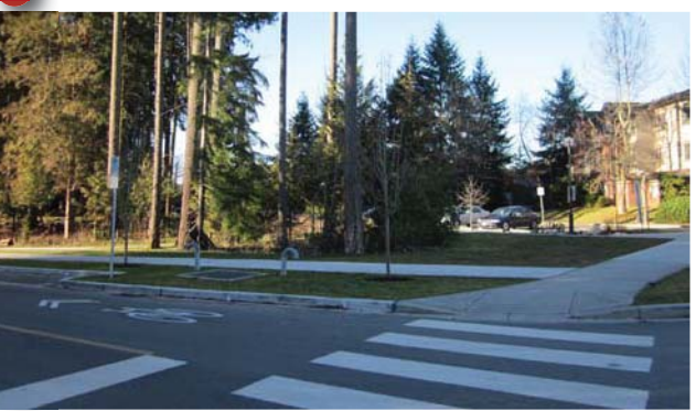
G Looking back at southern most crosswalk