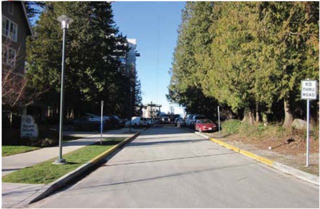
B Looking North down interior road