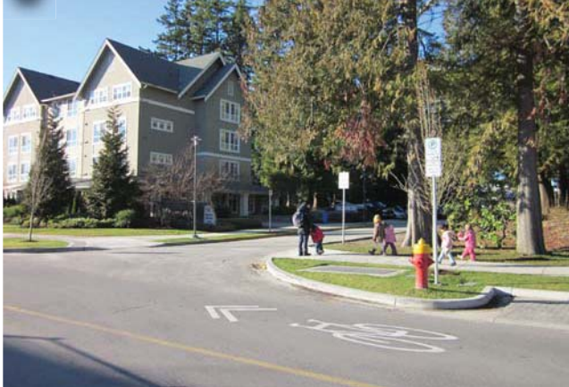
C Looking at southwest crosswalk from across Thunderbird