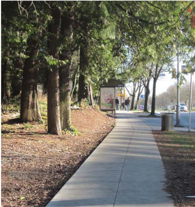
A Looking South at bus stop along Wesbrook