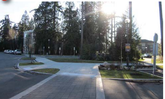
F Looking back at eastern most crosswalk