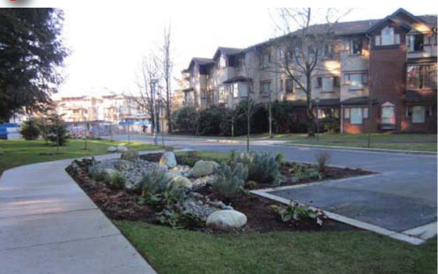
E Looking towards mid block crossing