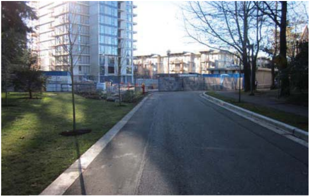
D Looking northwest down interior road